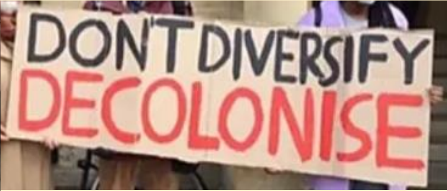
Image says don't diversify decolonise

Decolonisation has been regarded as a buzzword due to it being heavily discussed recently, however this should not be regarded as a tick-box diversity exercise for it to be meaningful, it is an engaged complex process. It requires rigorous reflection on your own values, assumptions and biases.