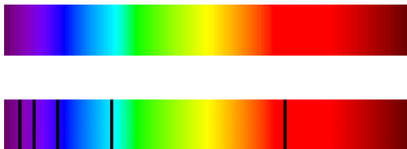
Figure 1 The spectrum of white light (top) and the same spectrum viewed after passing through an atmosphere of hydrogen (bottom) (for use with Question 5).

Which of the following statements is true?